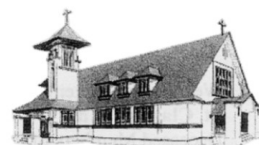
St Clares Mission Est 1849