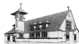
St Clares Mission Est 1849